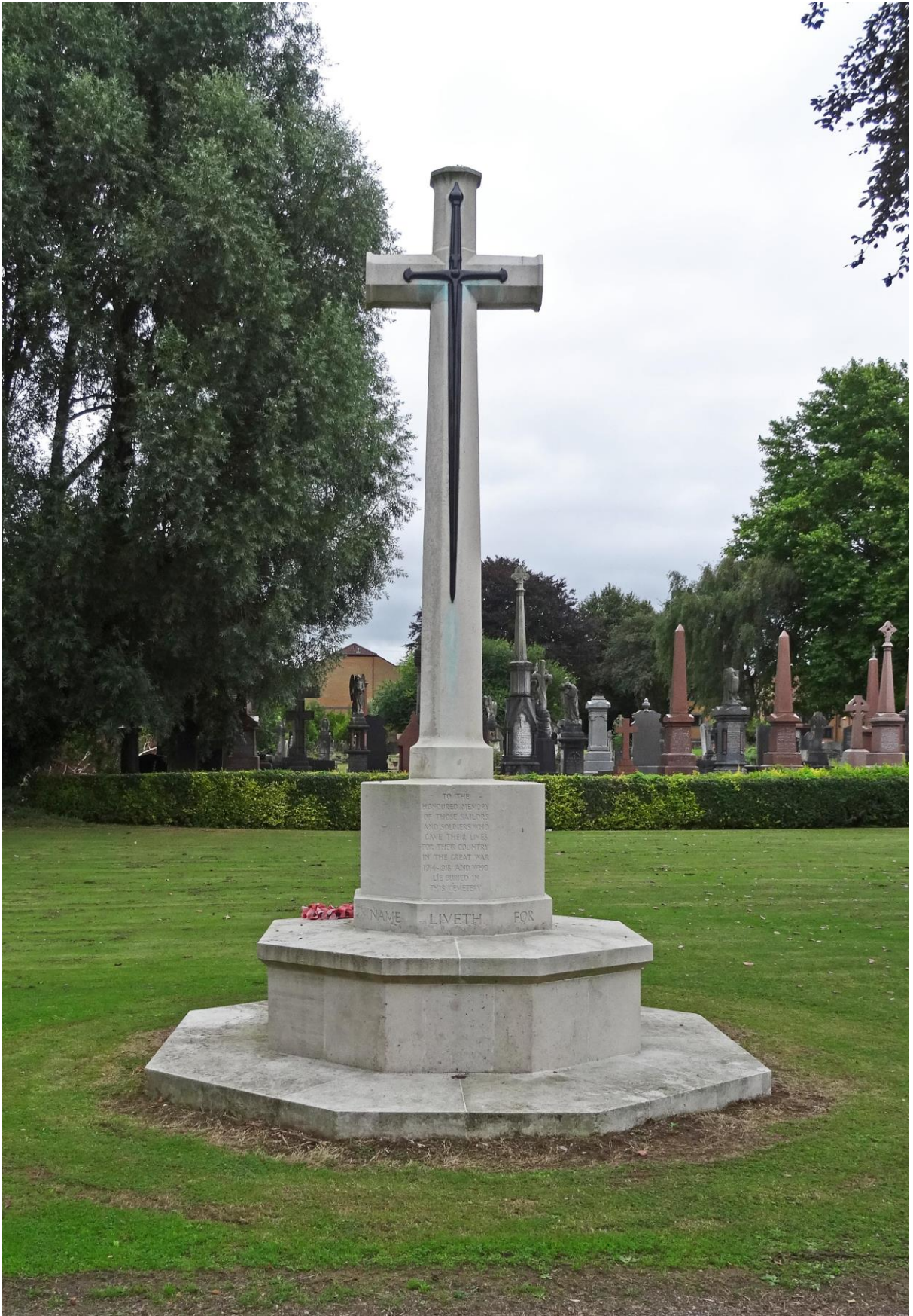
Cross of Sacrifice Avon View Cemetery, Bristol