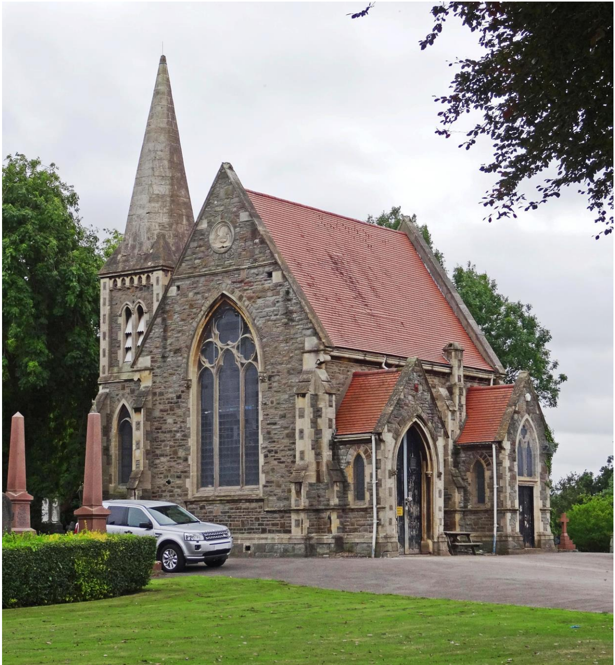
Avon View Cemetery, Bristol