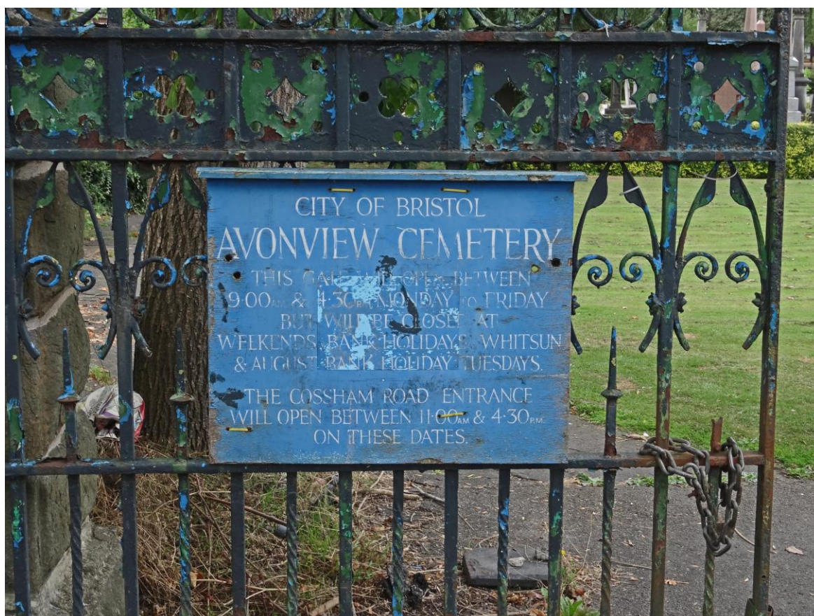
Avon View Cemetery, Bristol